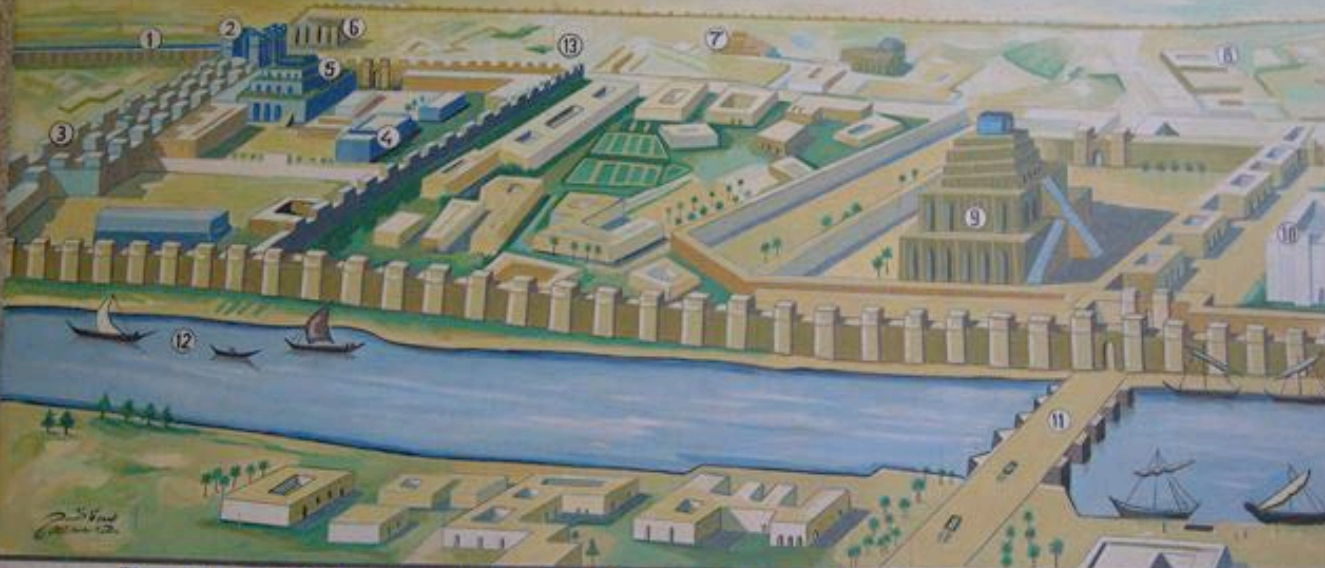
Plan of the city of Babylon during the time of the King Nabu Chud Nezzar II 600 B.C

هكذا كانت مدينة بابل في عهد الملك نوحنصر الثاني 600 ق.م