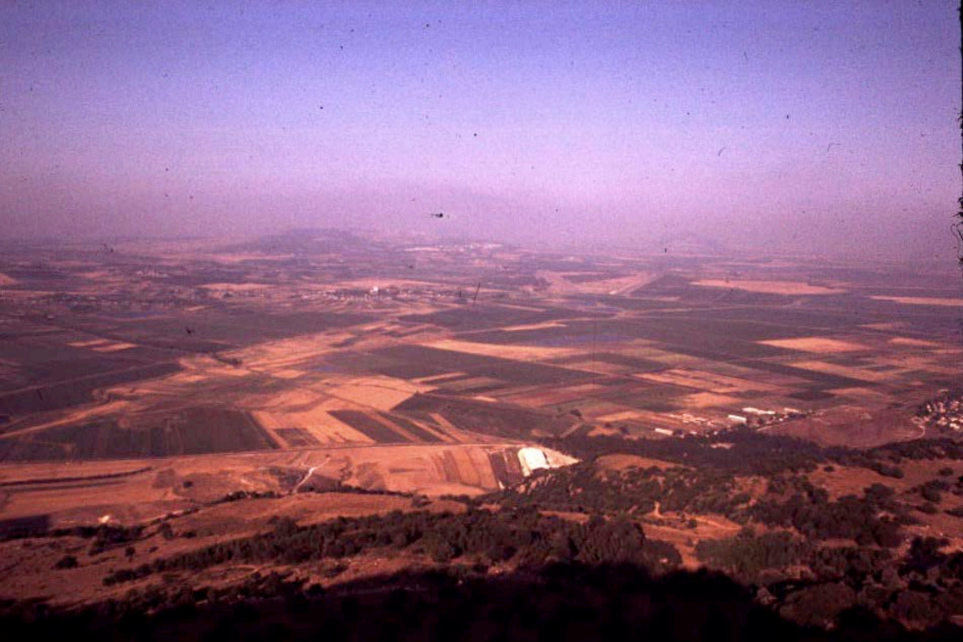
Nazareth from Mt Carmel