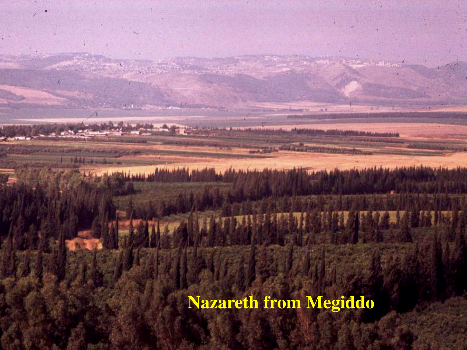
Nazareth from Megiddo