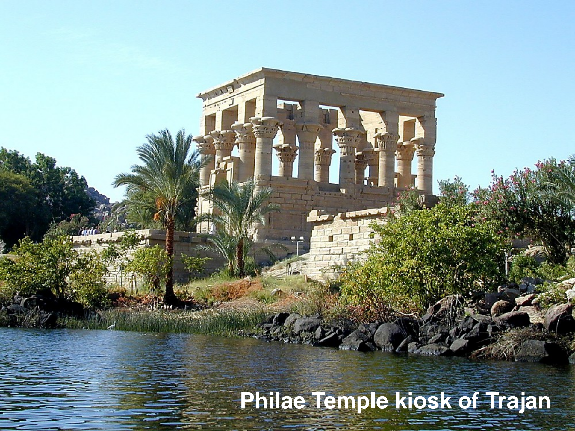
Philae Temple kiosk of Trajan