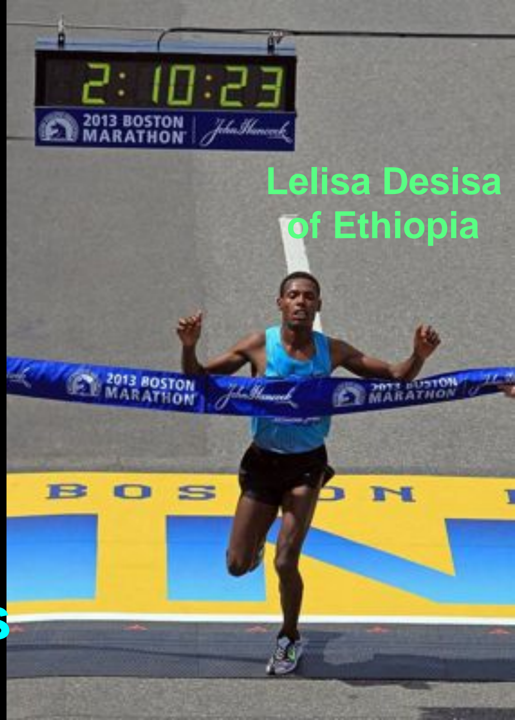
Lelisa Desisa of Ethiopia