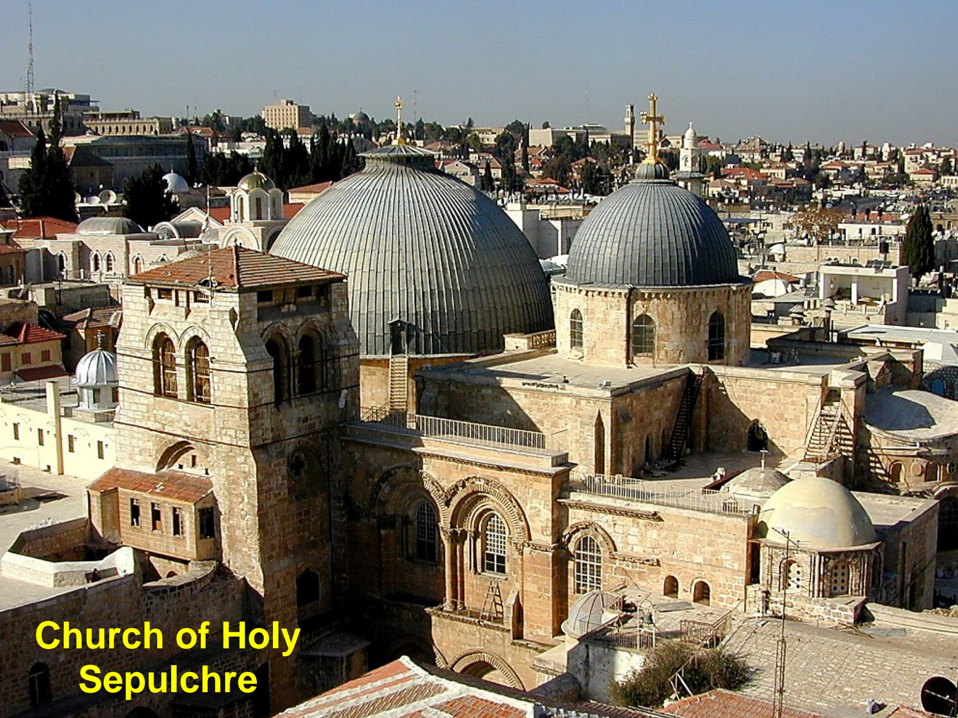
Church of Holy Sepulchre