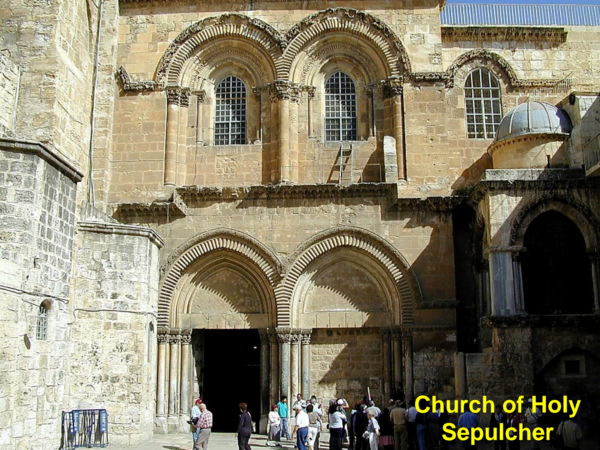
Church of Holy Sepulcher