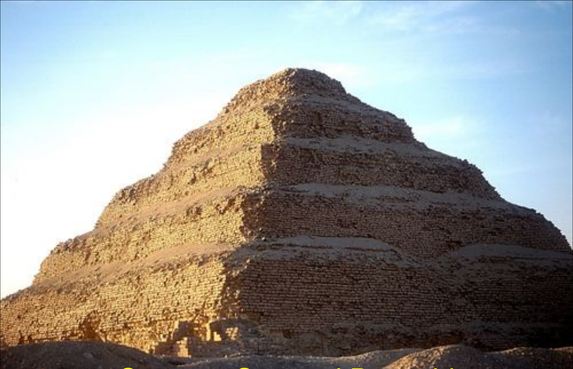
Saqqara Stepped Pyramid By Zoser before Abram