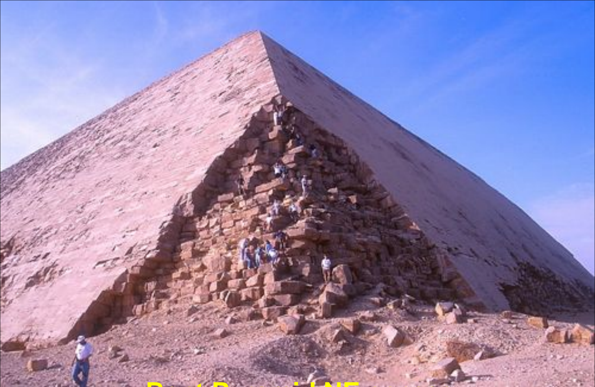
Bent Pyramid NE corner Before Abram - 4th tallest