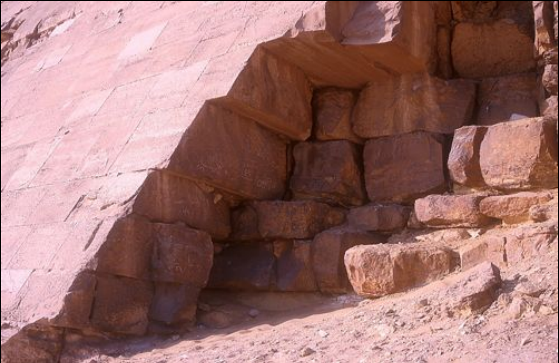
Bent Pyramid outer casing