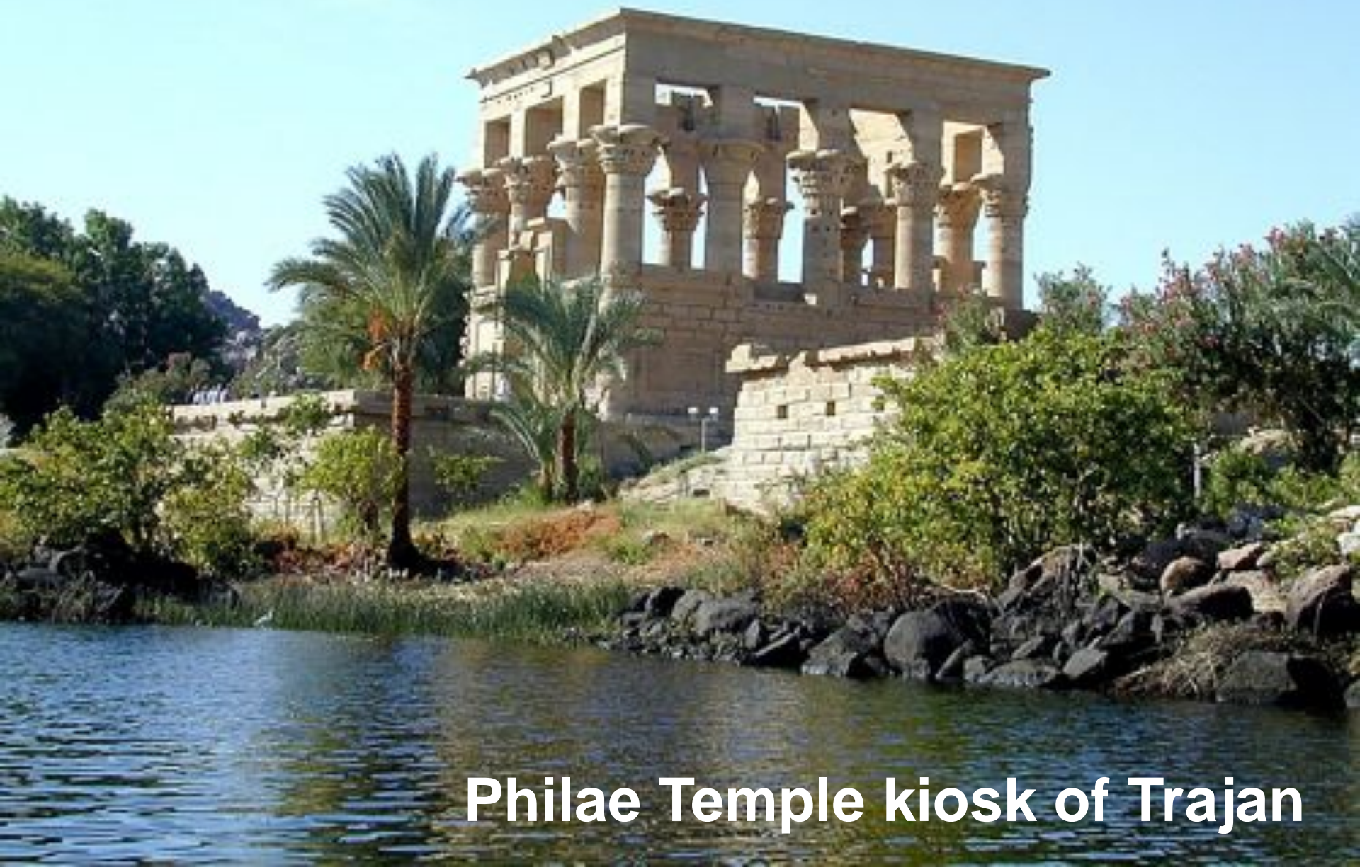
Philae Temple kiosk of Trajan