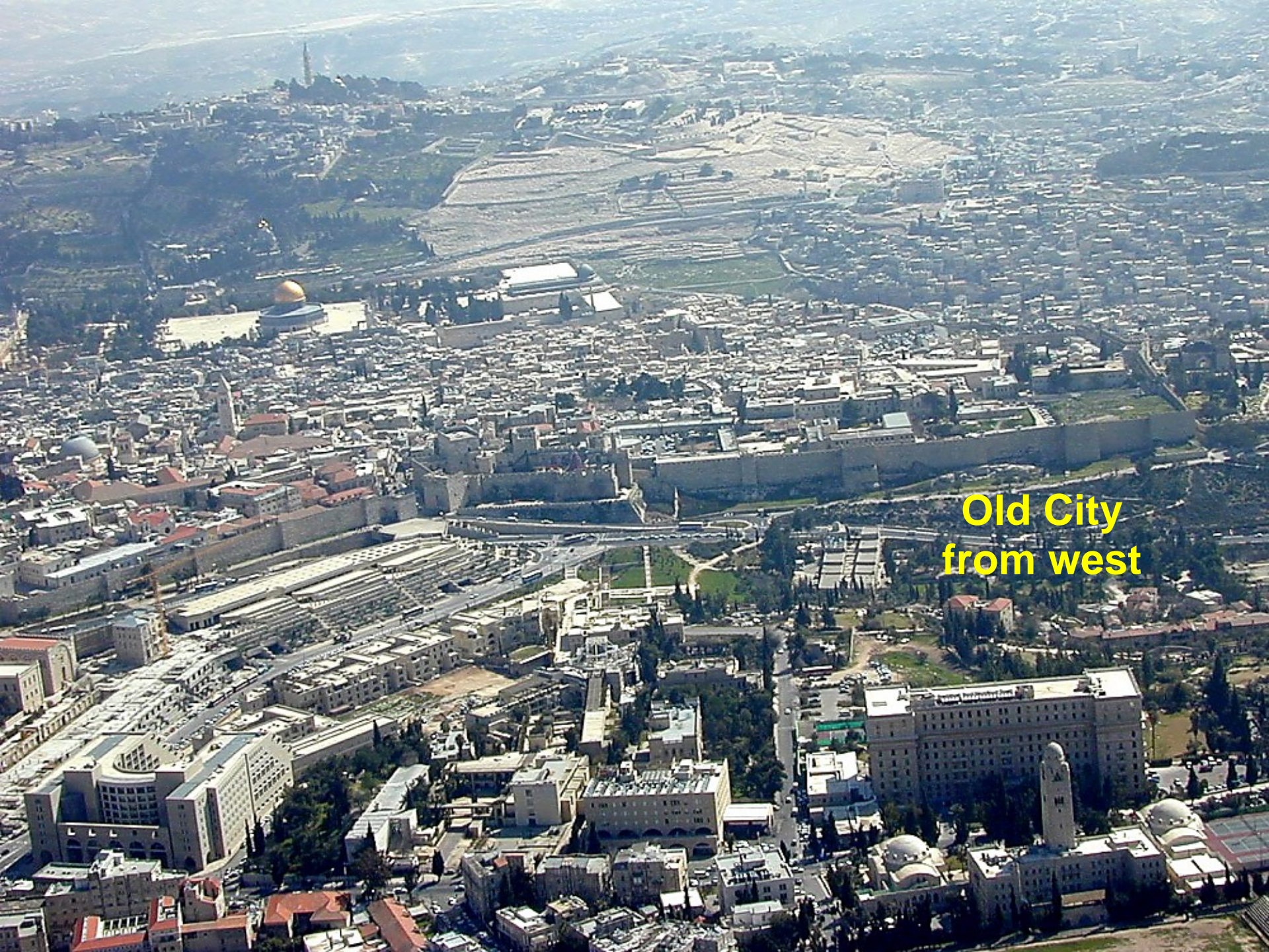
Old City from west