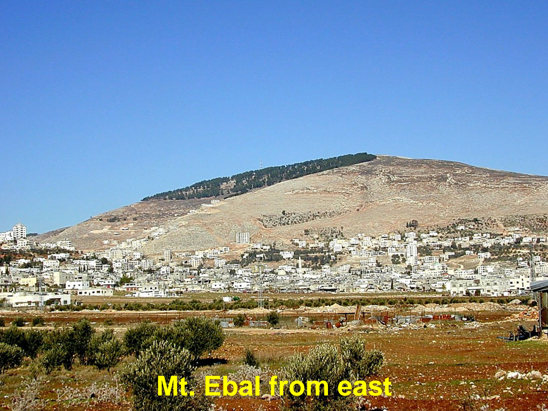
Mt. Ebal from east