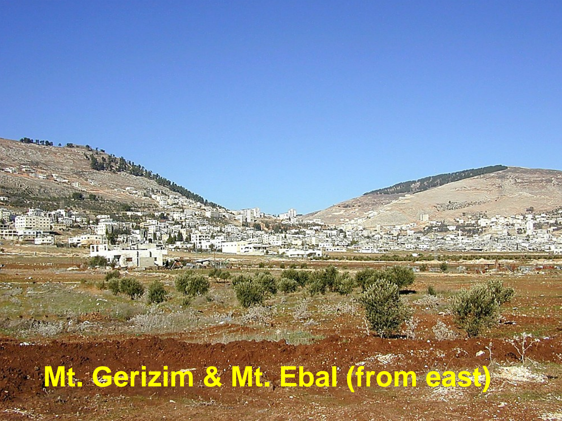
Mt. Gerizim & Mt. Ebal (from east)