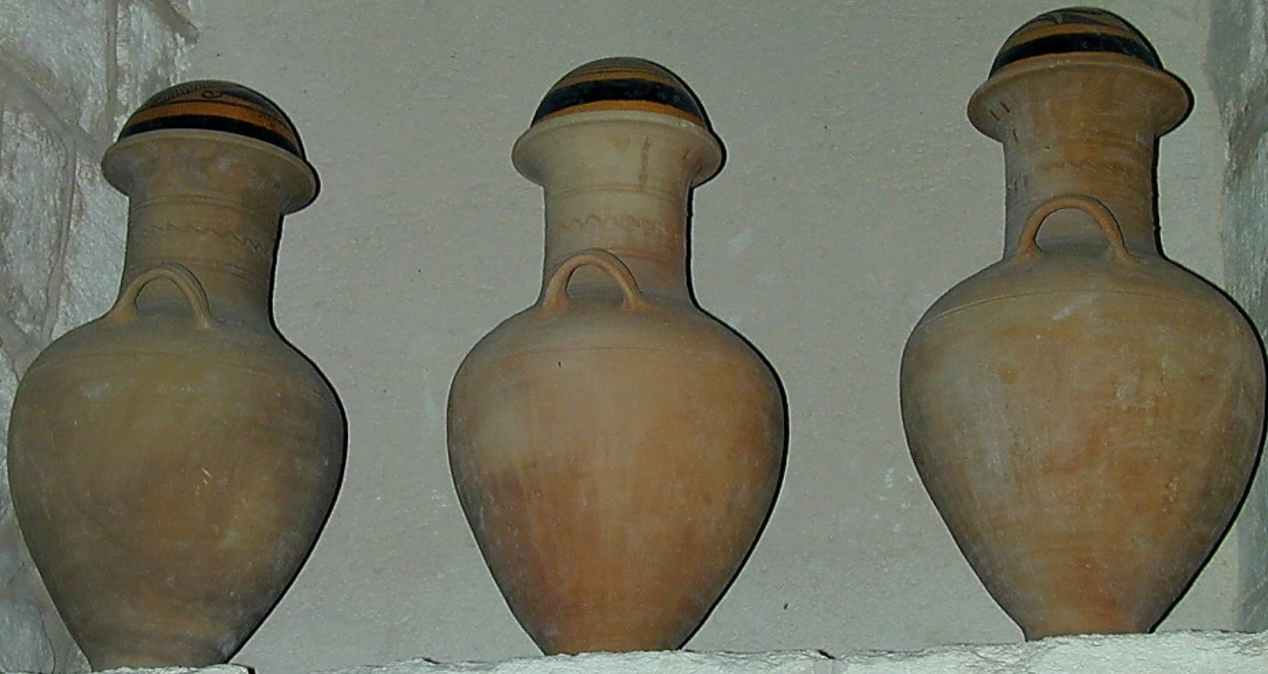
Clay wedding jars at Kefar Kenna