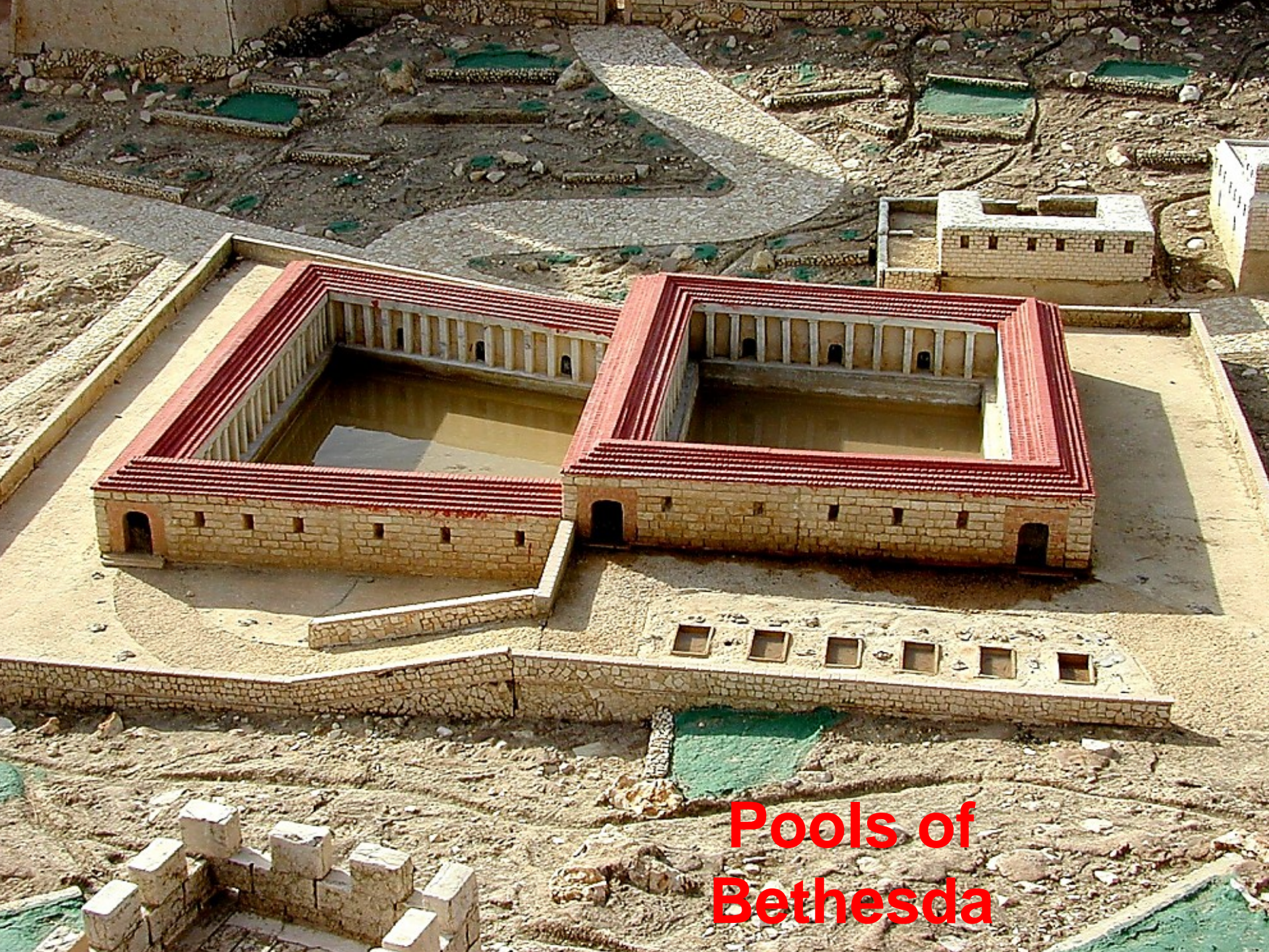
Pools of Bethesda