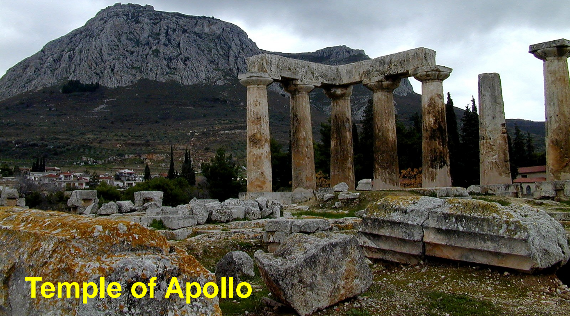
Temple of Apollo