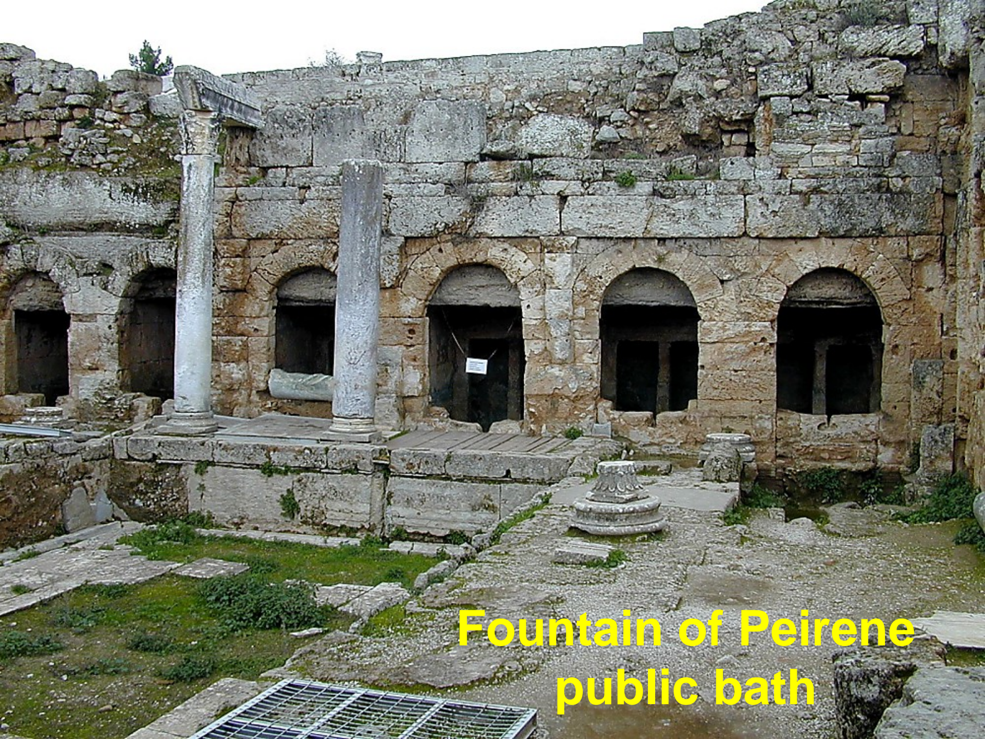
Fountain of Peirene public bath