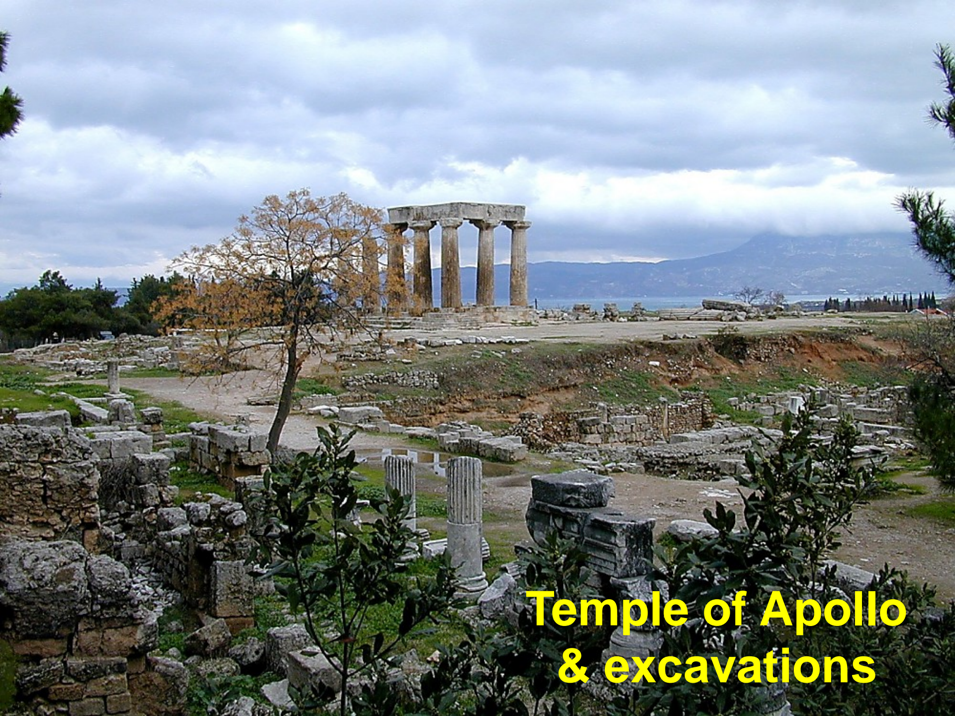
Temple of Apollo & excavations