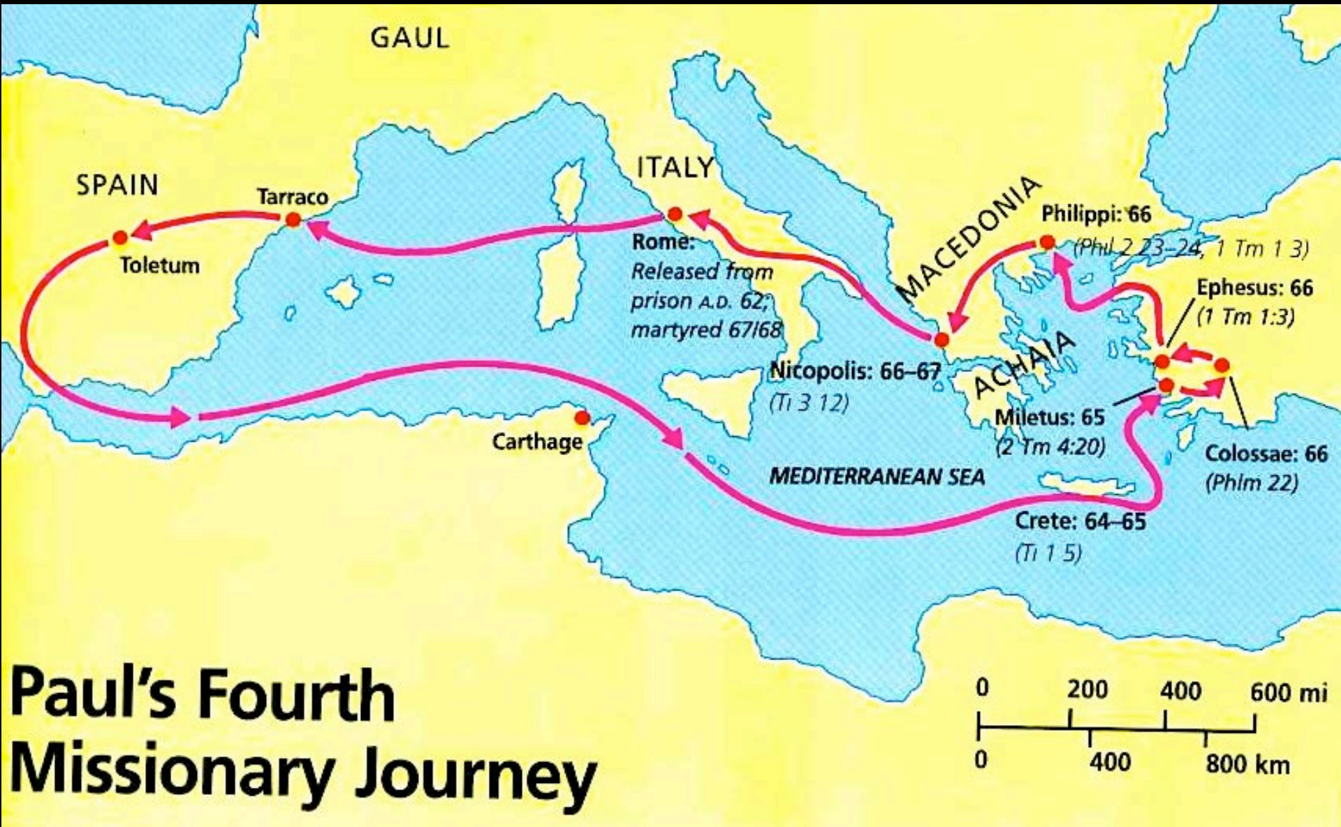
Paul's Fourth Missionary Journey