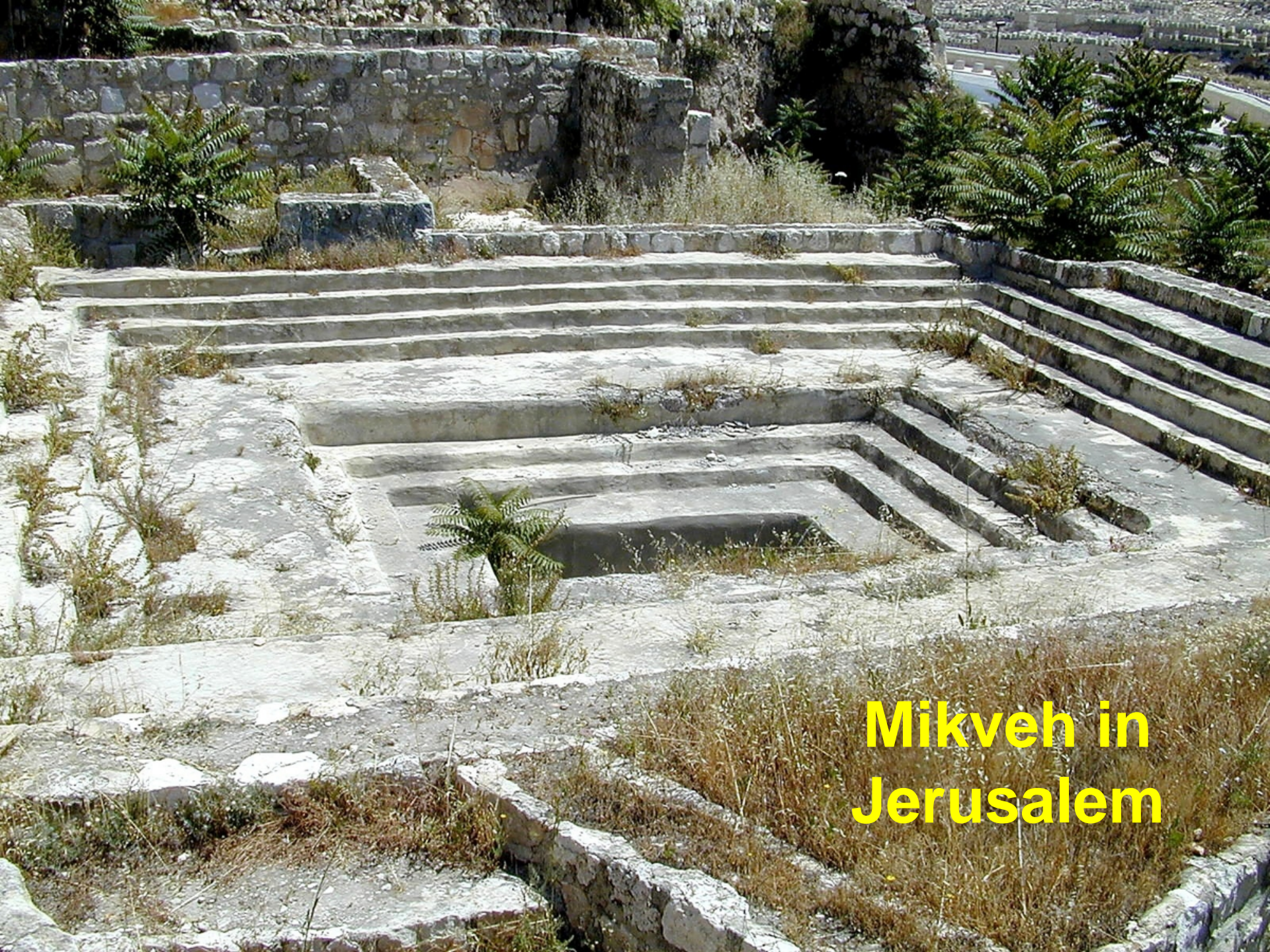
Mikveh in Jerusalem