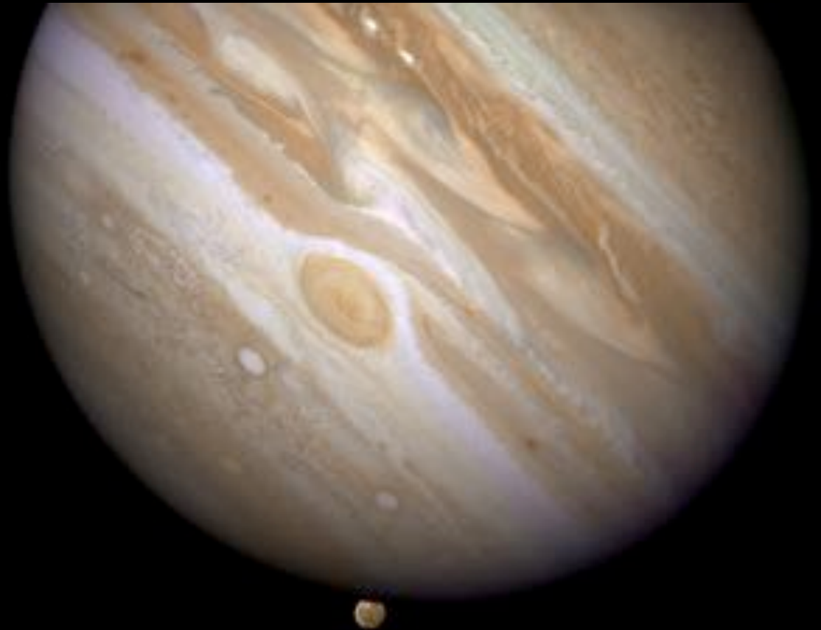
Jupiter & Ganymede