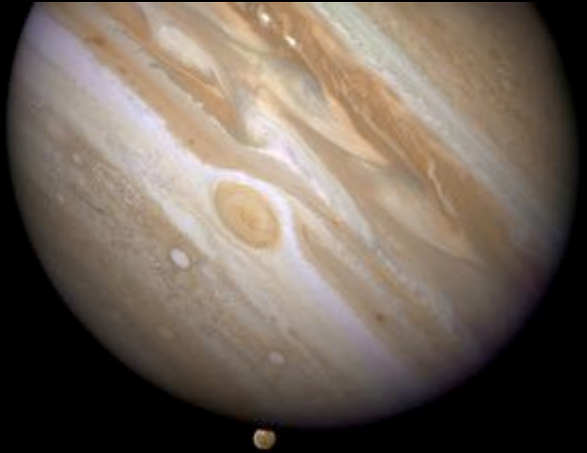
Jupiter & Ganymede