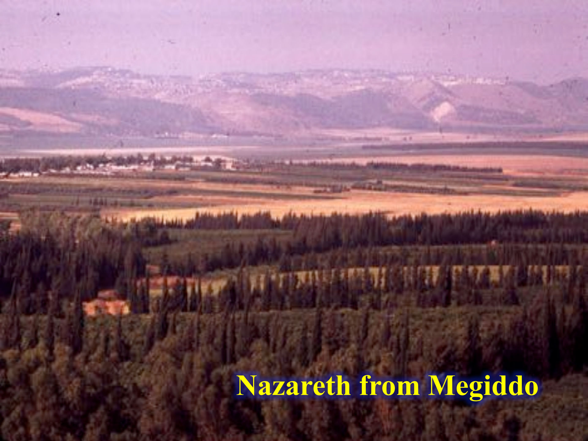
Nazareth from Megiddo