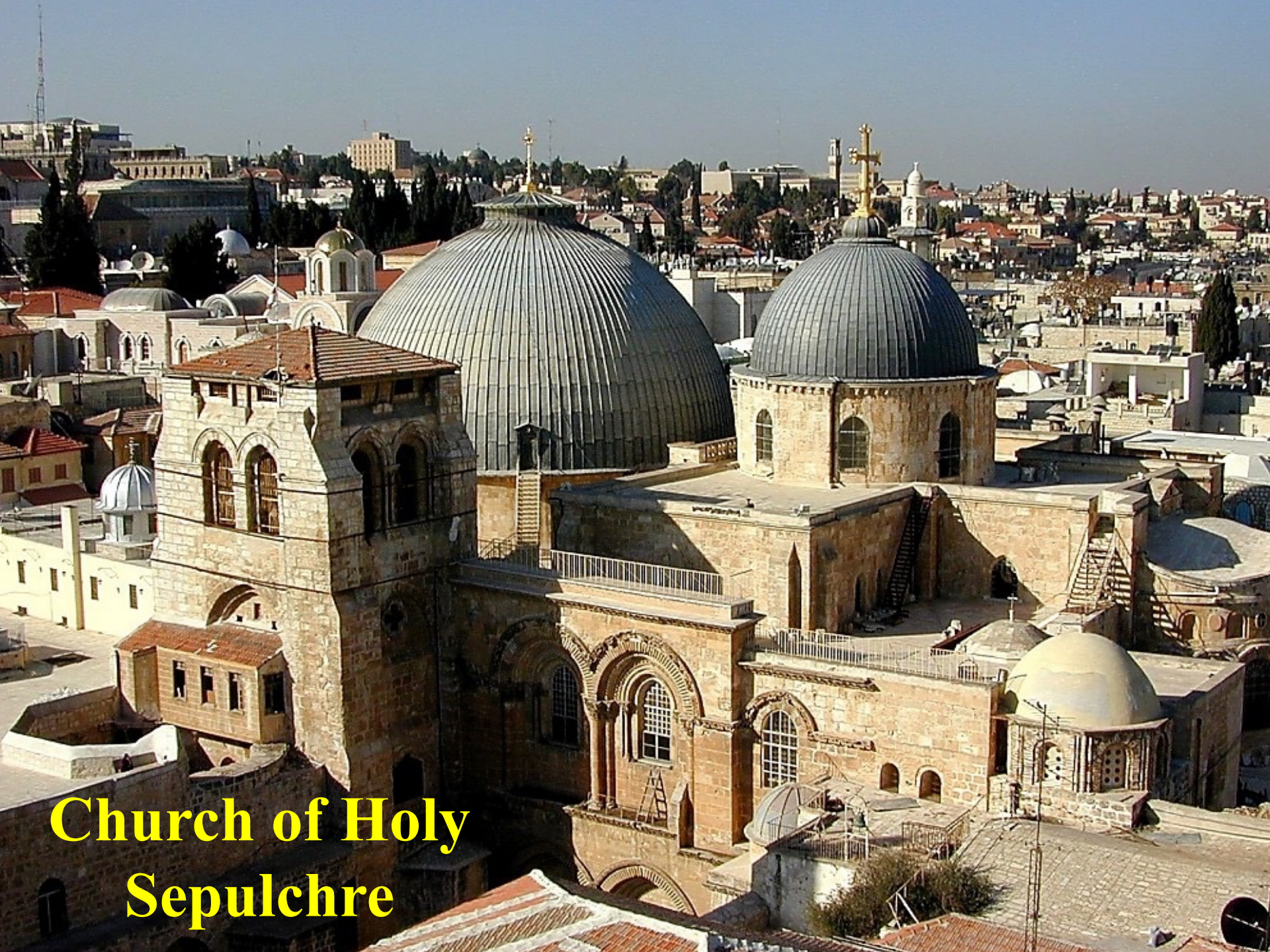
Church of Holy Sepulchre