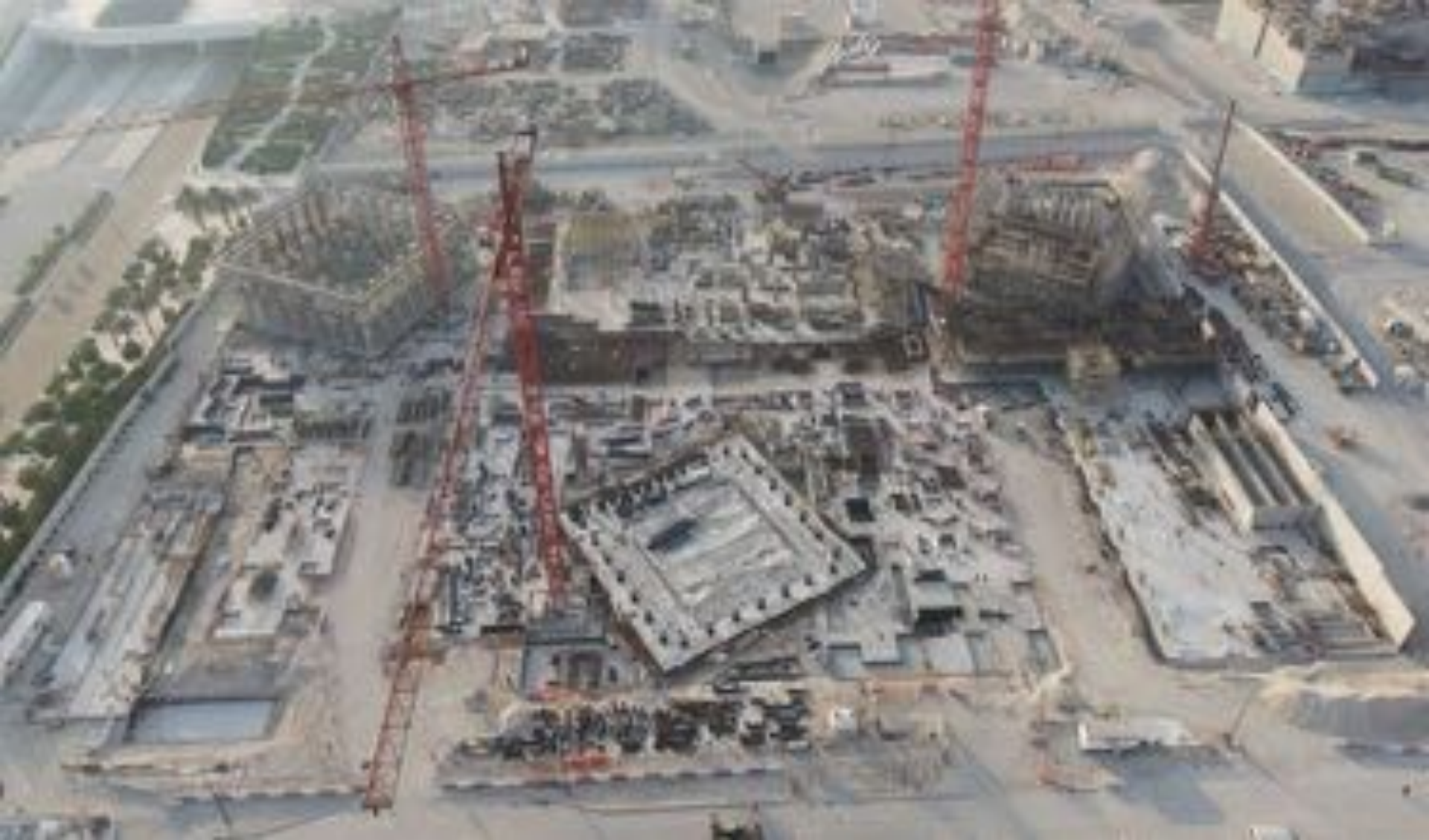
Abraham Family House in Abu Dhabi, UAE (opens in 2022)