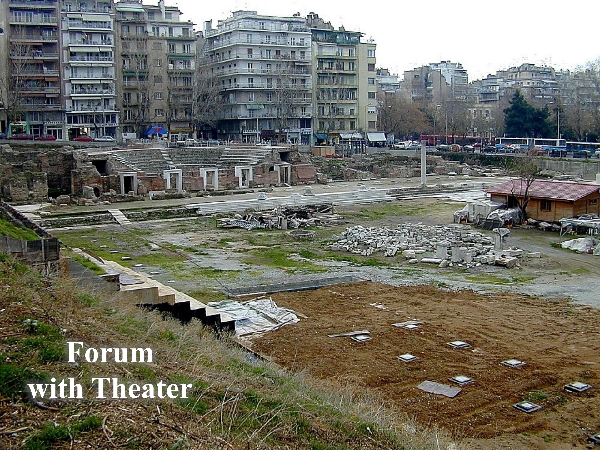
Forum with Theater