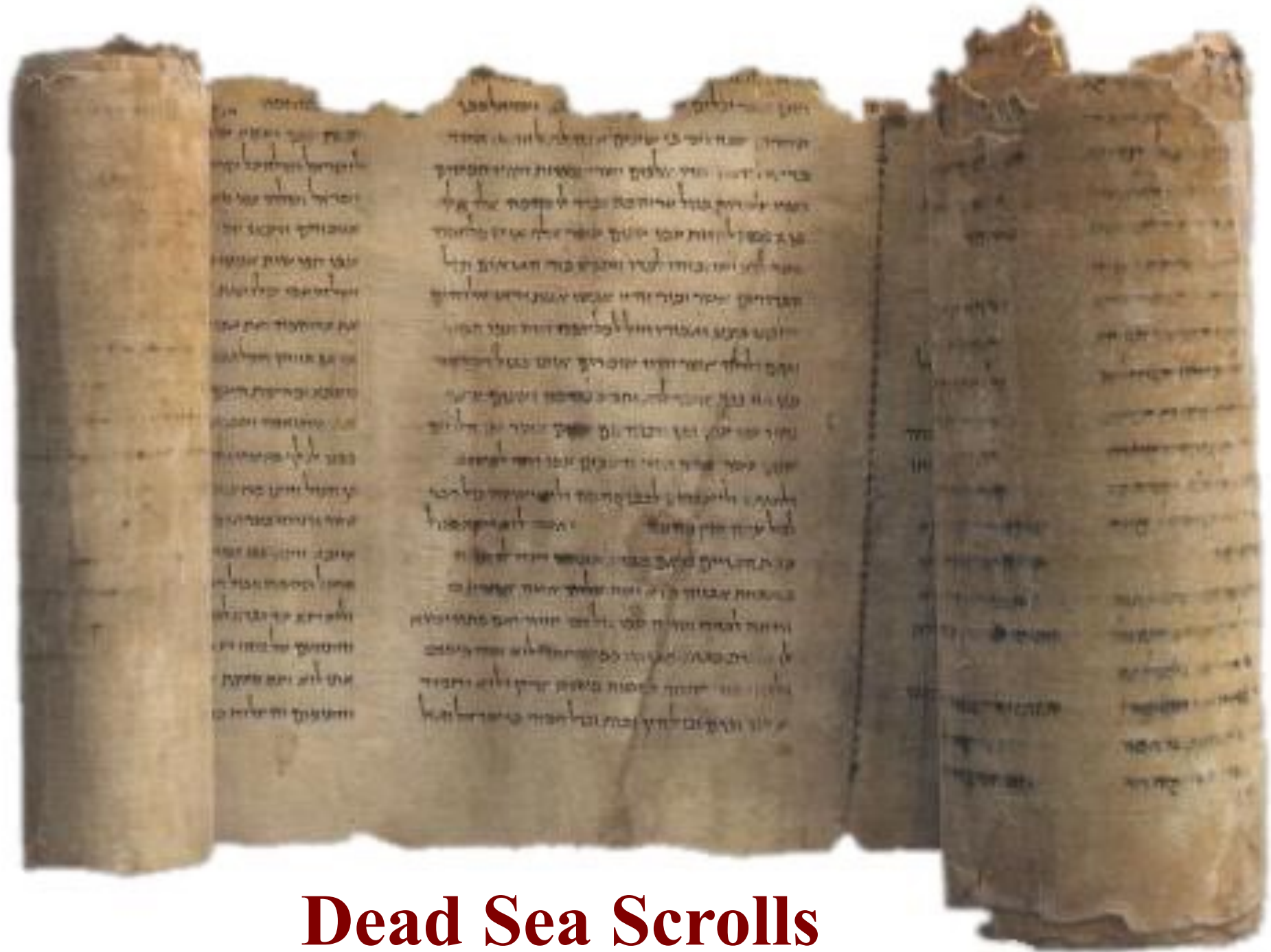
Dead Sea Scrolls