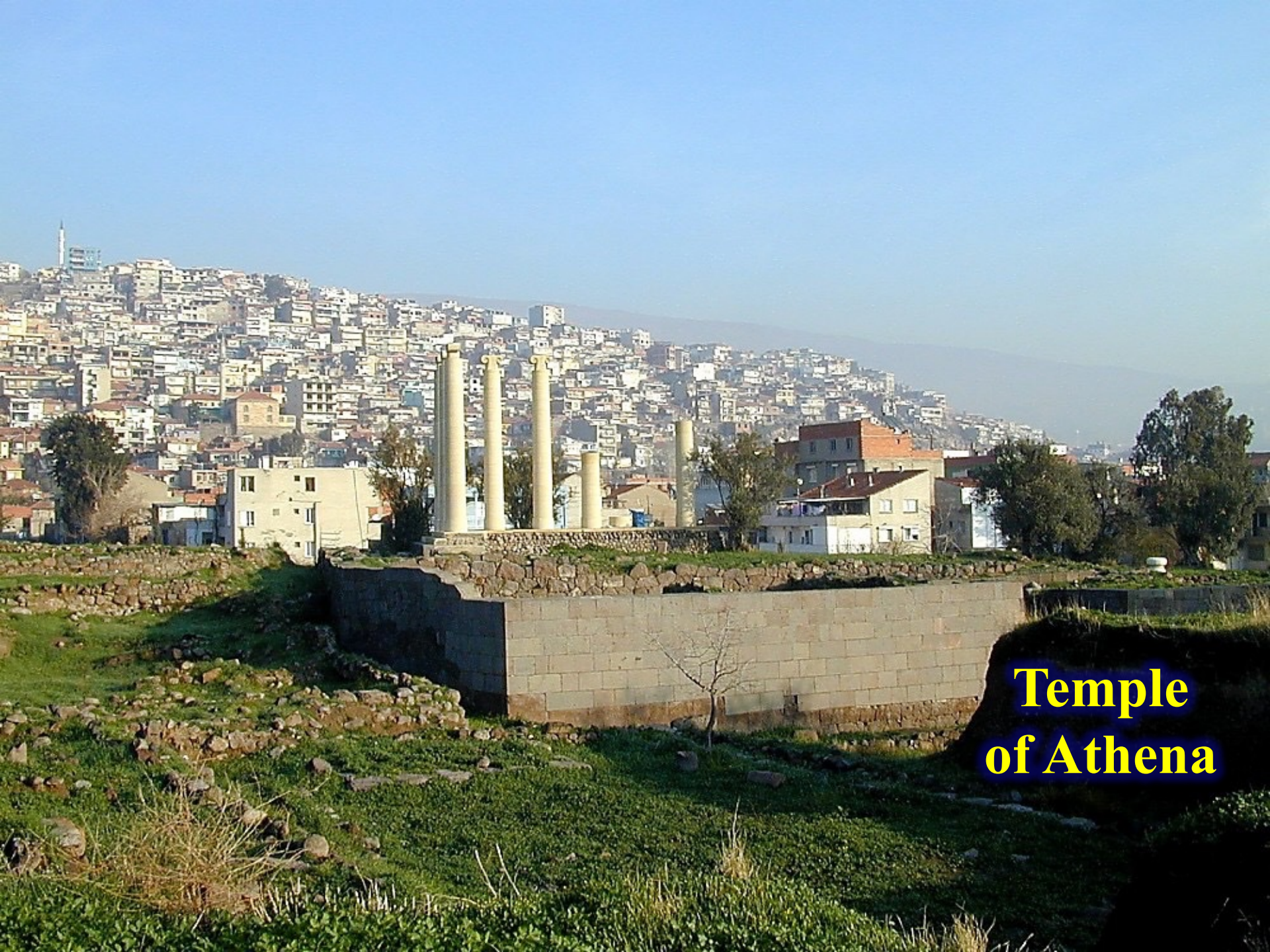
Temple of Athena