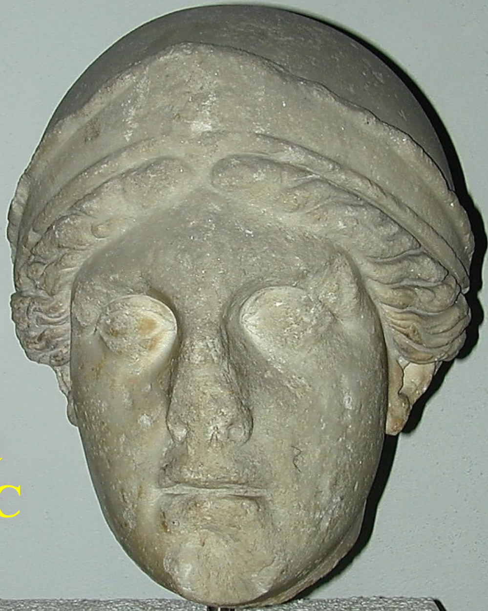
Athena 2nd c BC