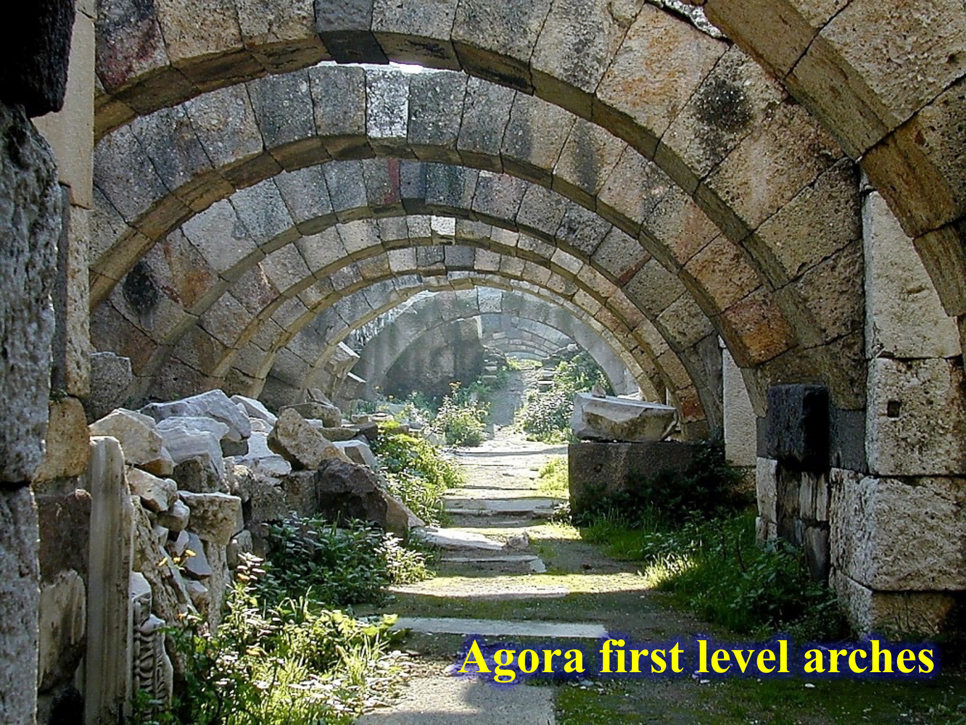
Agora first level arches