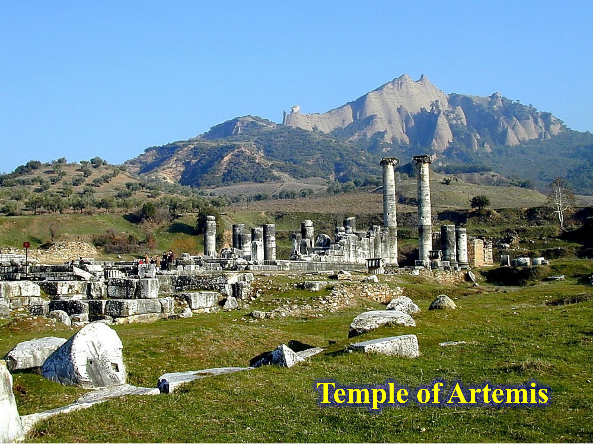
Temple of Artemis