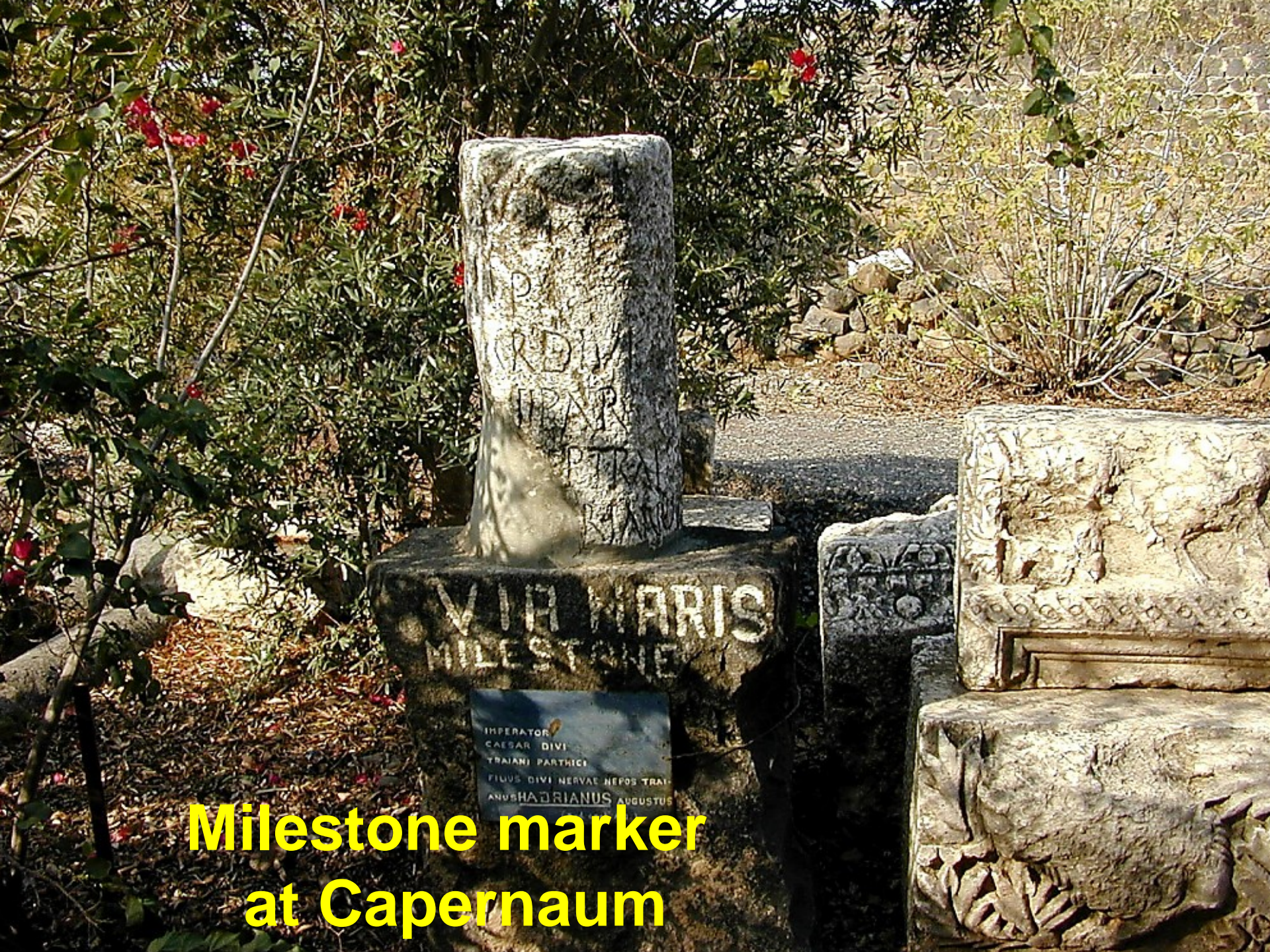
Milestone marker at Capernaum