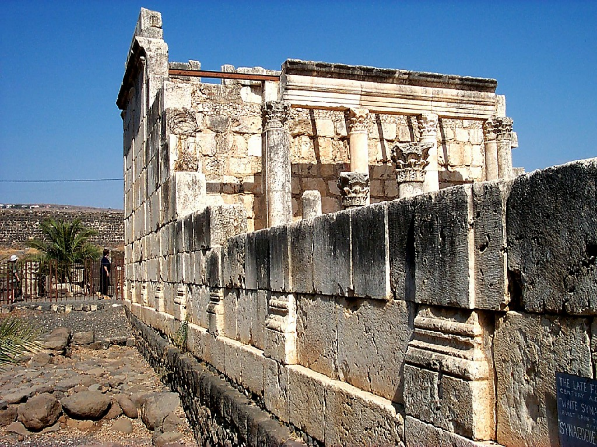
THE LATE FOURTH CENTURY A.D. "WHITE SYNAGOGUE" BUILT UPON THE SITE OF AN EARLIER SYNAGOGUE