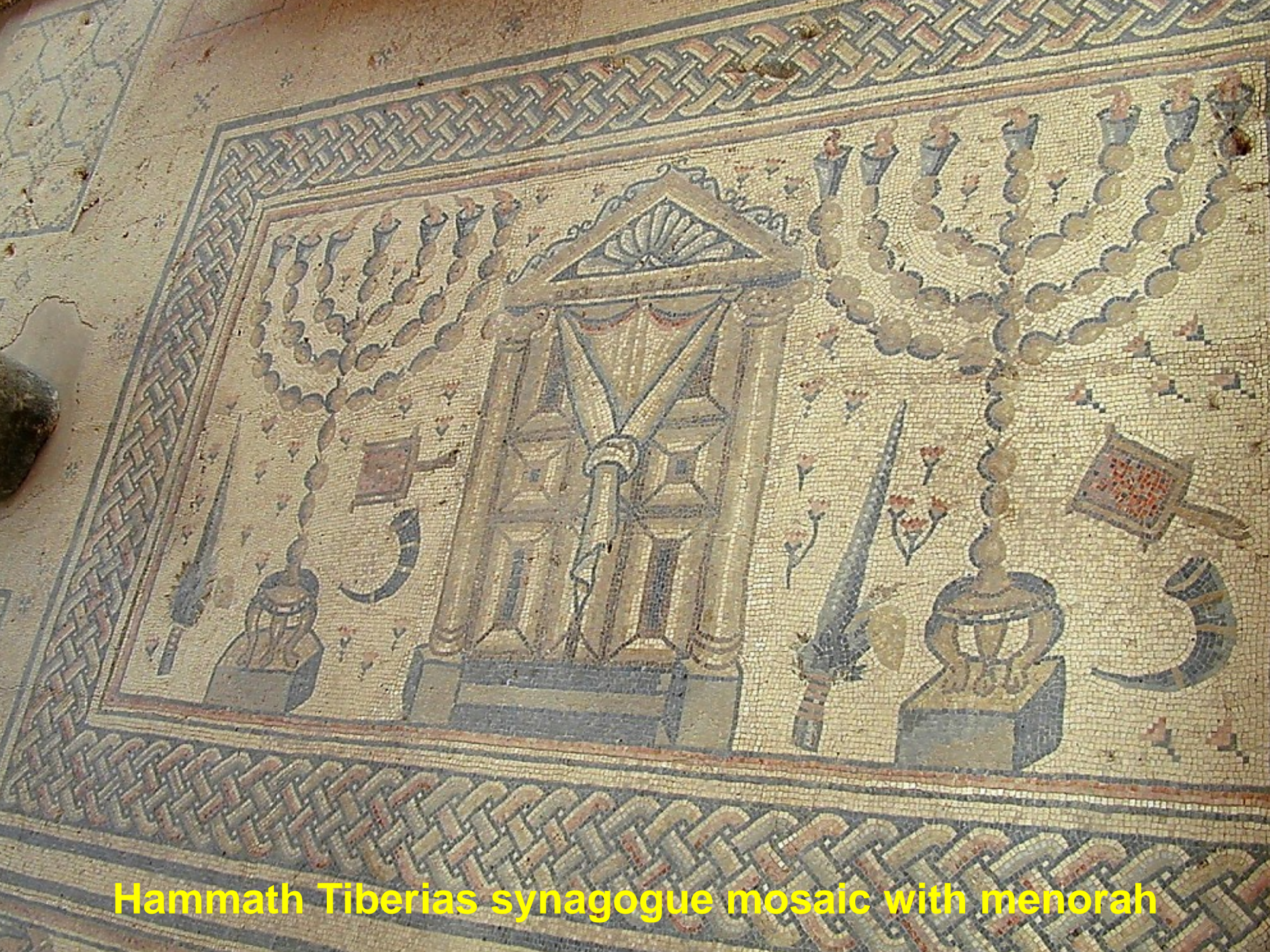
Hammath Tiberias synagogue mosaic with menorah