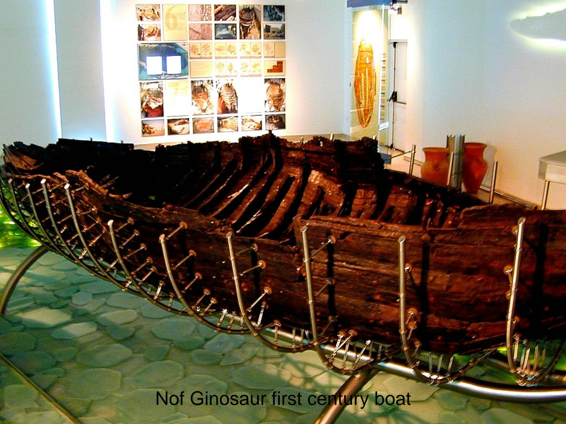
Nofer's Gilded Sarcophagus first century boat