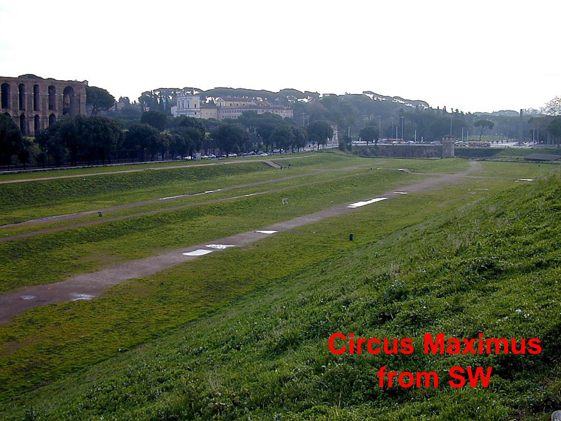
Circus Maximus from SW