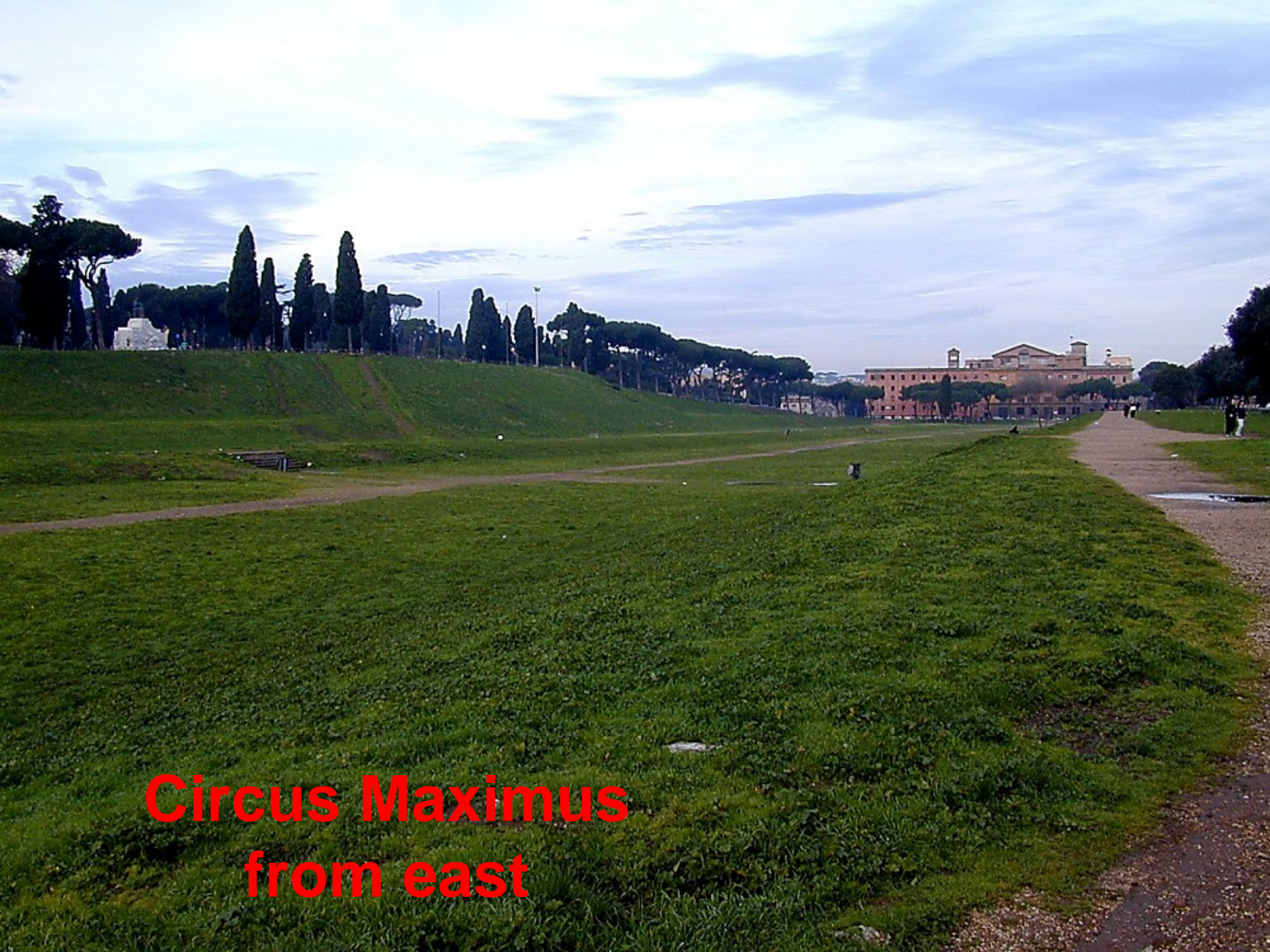
Circus Maximus from east