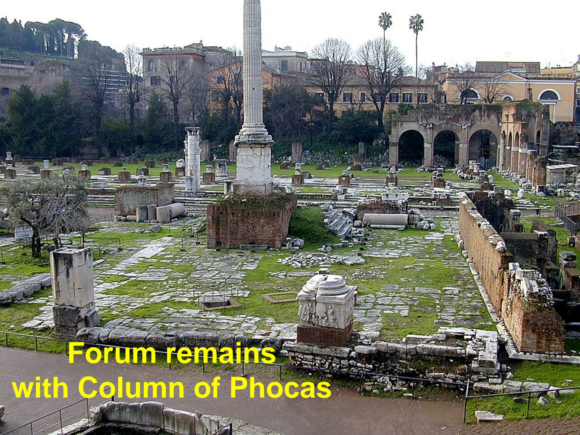
Forum remains with Column of Phocas