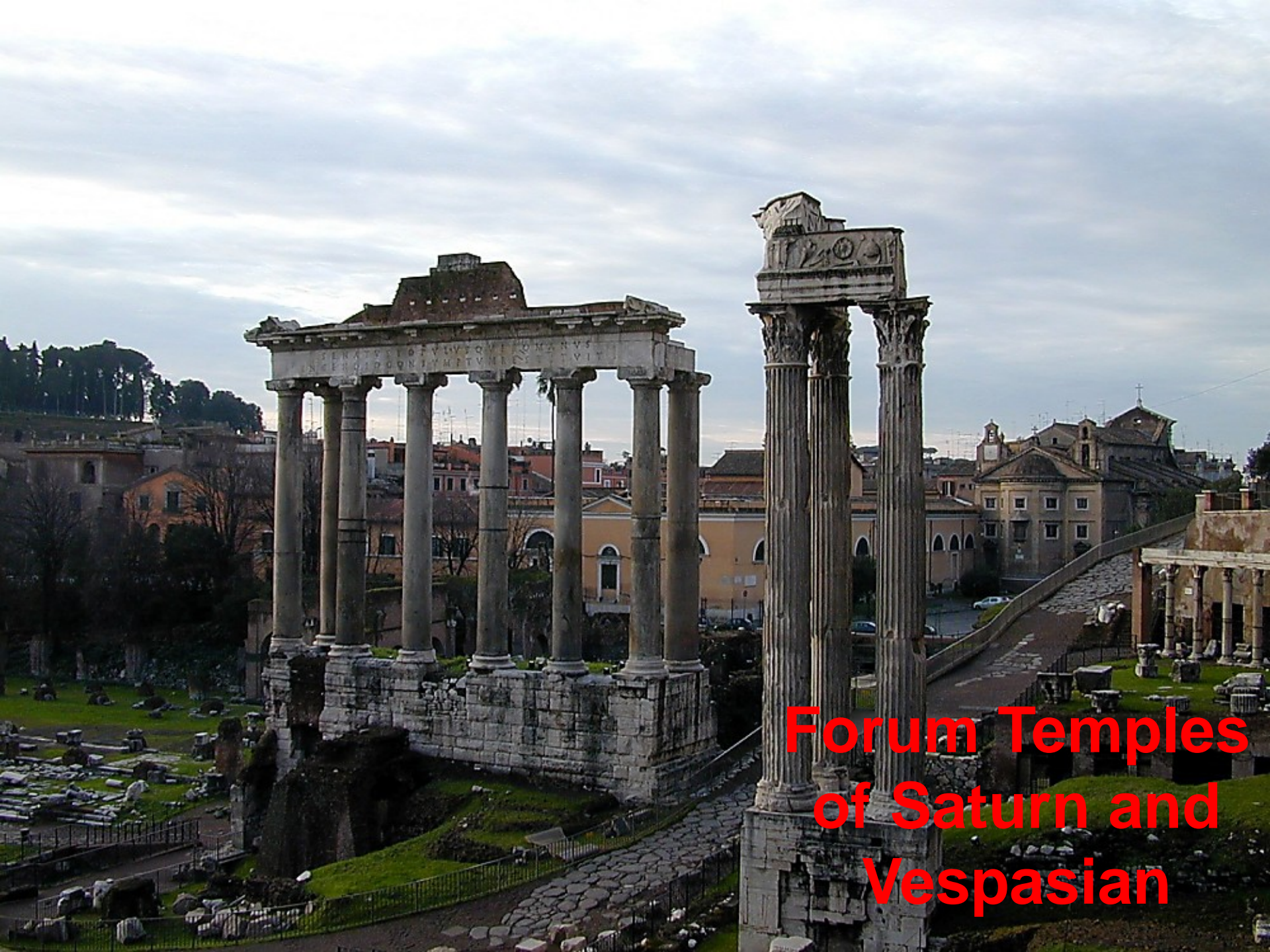
Forum Temples of Saturn and Vespasian