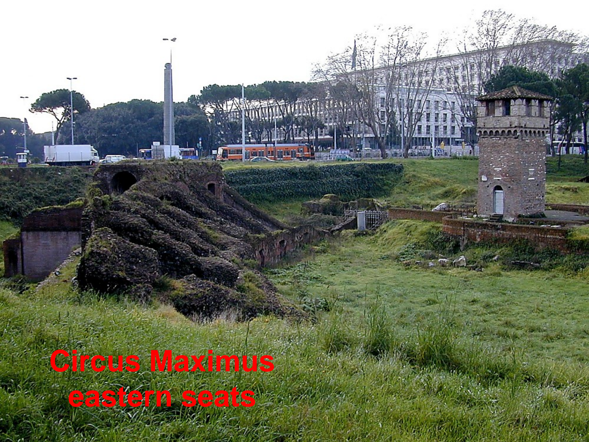
Circus Maximus eastern seats