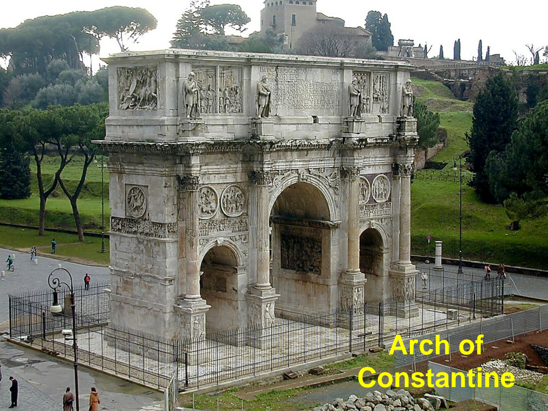
Arch of Constantine