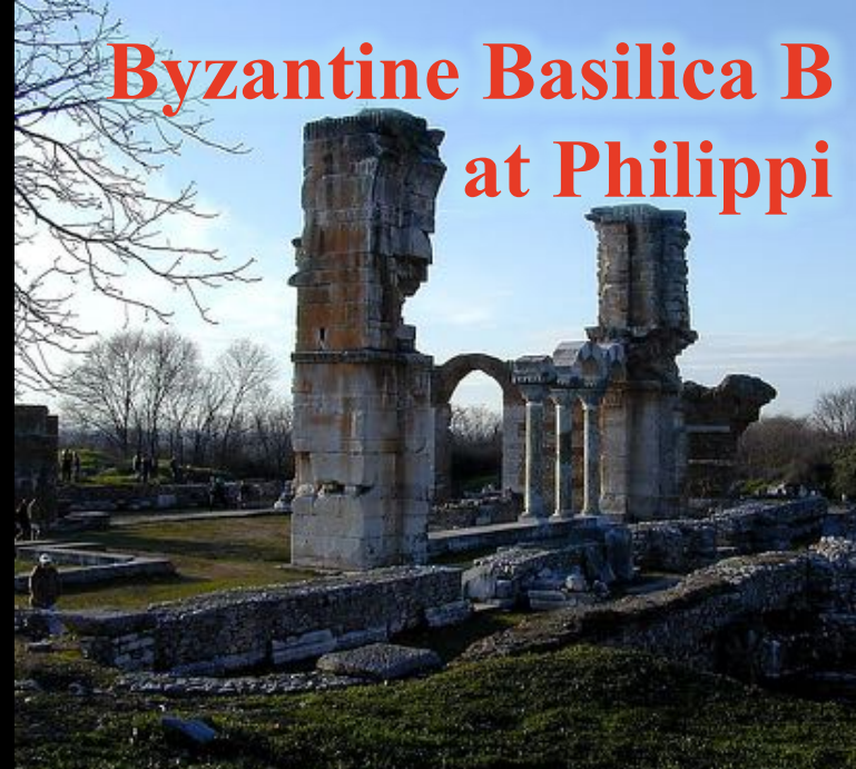
Byzantine Basilica B at Philippi