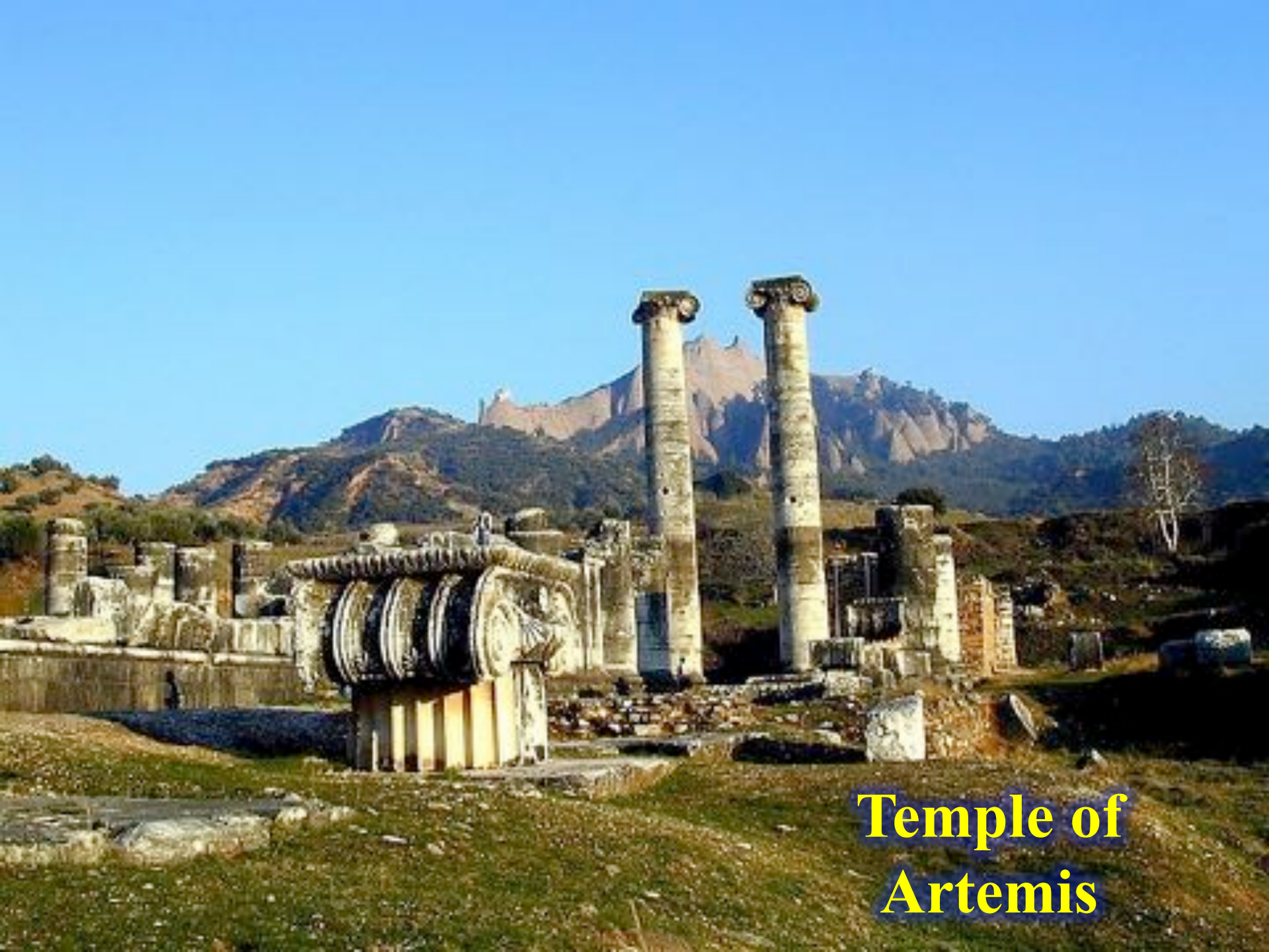
Temple of Artemis