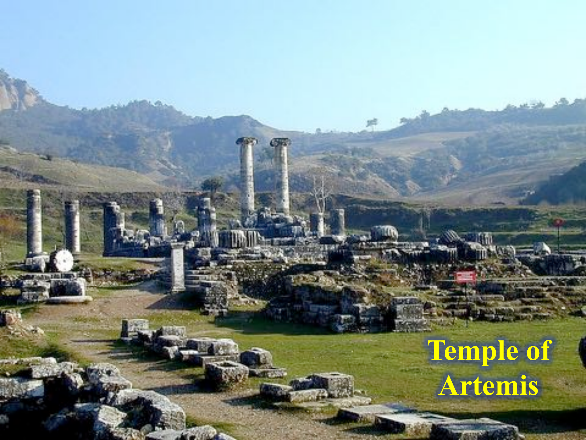
Temple of Artemis