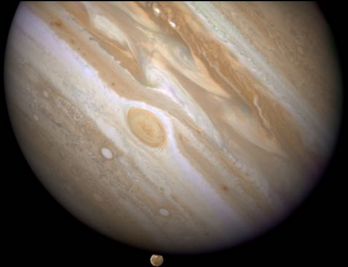
Jupiter & Ganymede