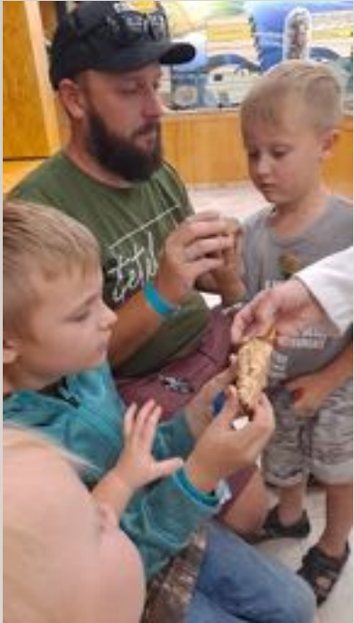
DINOSAUR JAW BONES AND VERTEBRAE