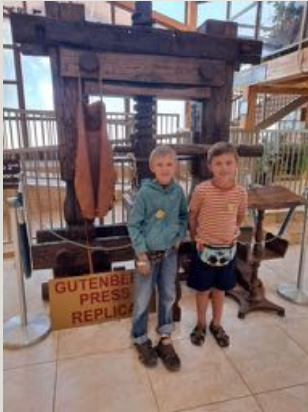
REPLICA OF GUTENBERG PRESS