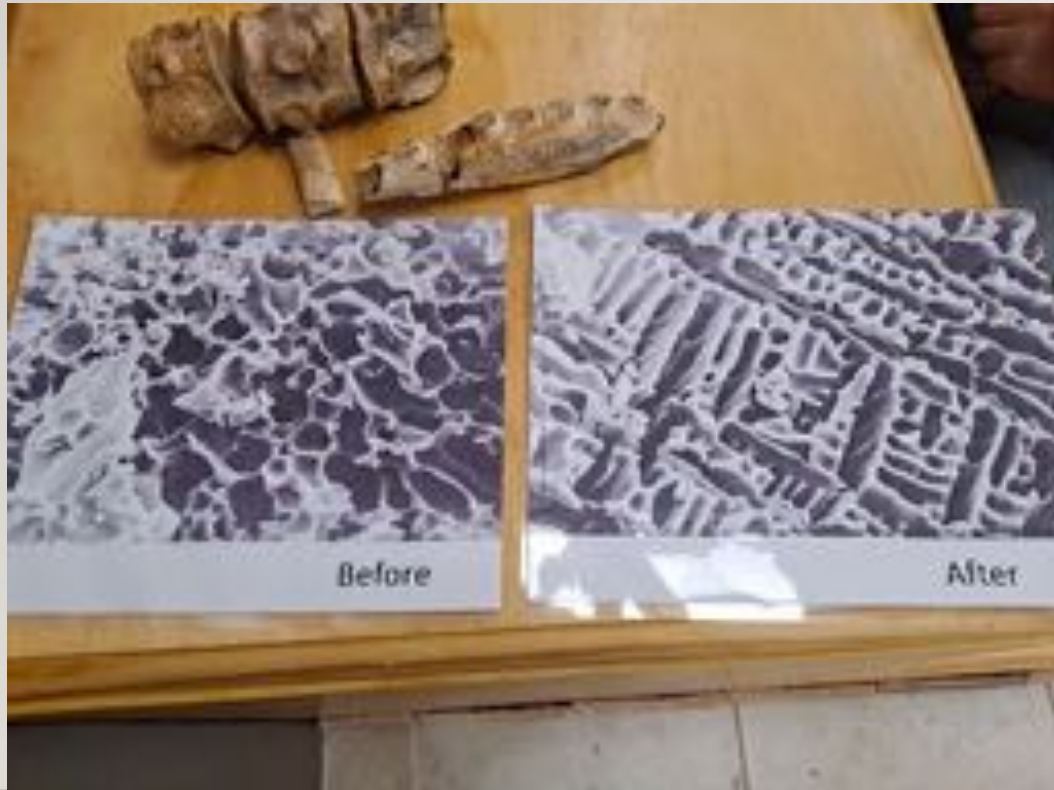
COPPERHEAD VENOM AND OXYGEN LEVELS