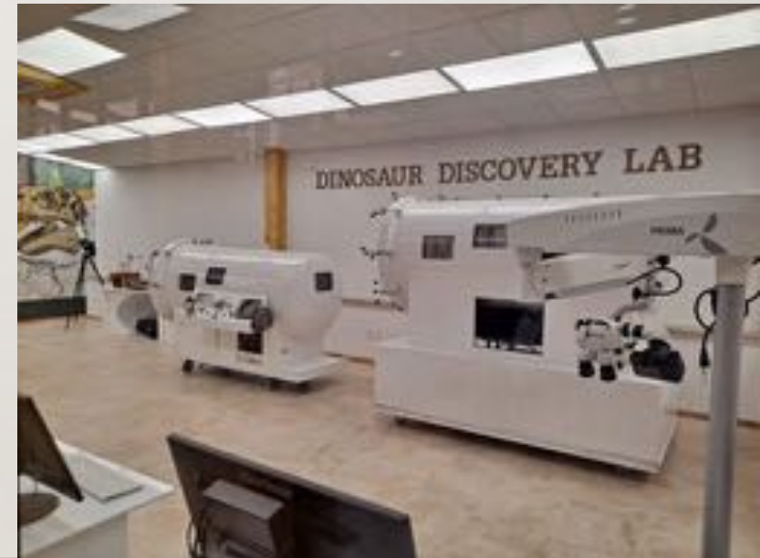
HYPERBARIC CHAMBER TO TEST VENOM AND OTHER STUFF