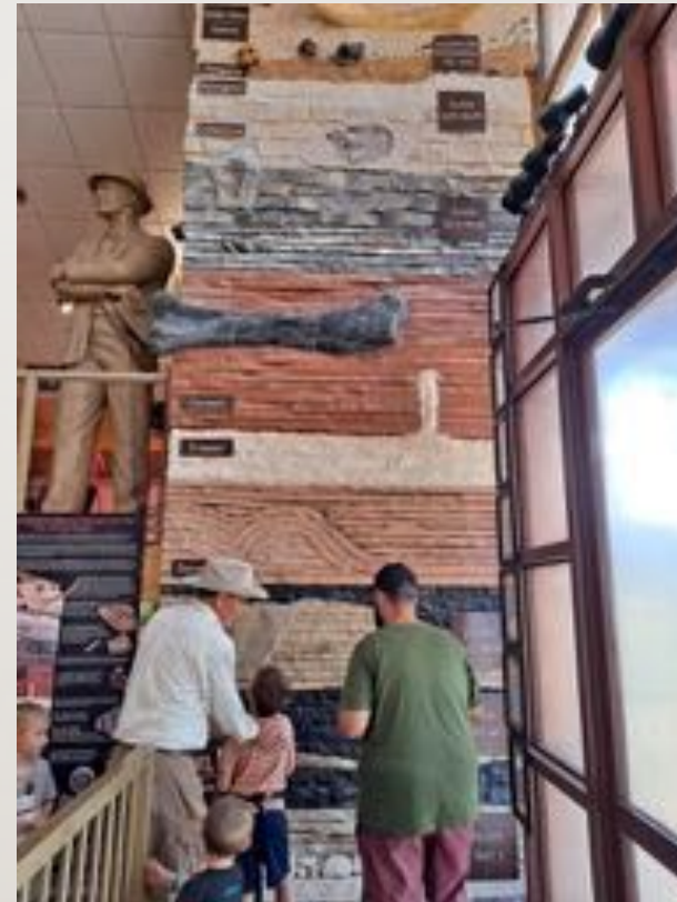
LAYERS OF SEDIMENT BY FLOOD