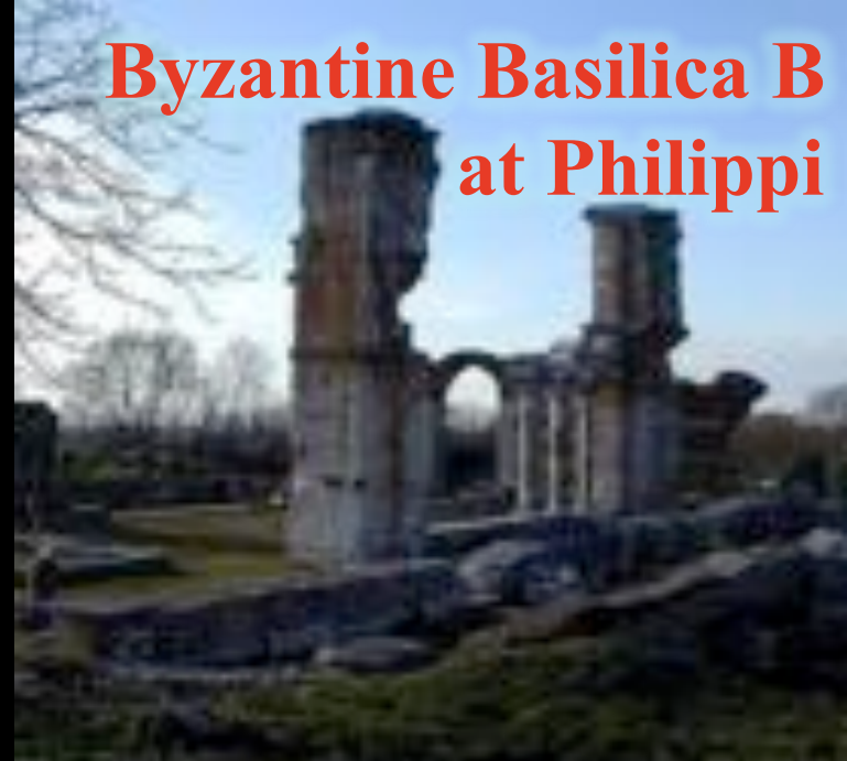
Byzantine Basilica B at Philippi