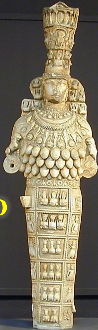
Artemis, 1st c AD World-wide