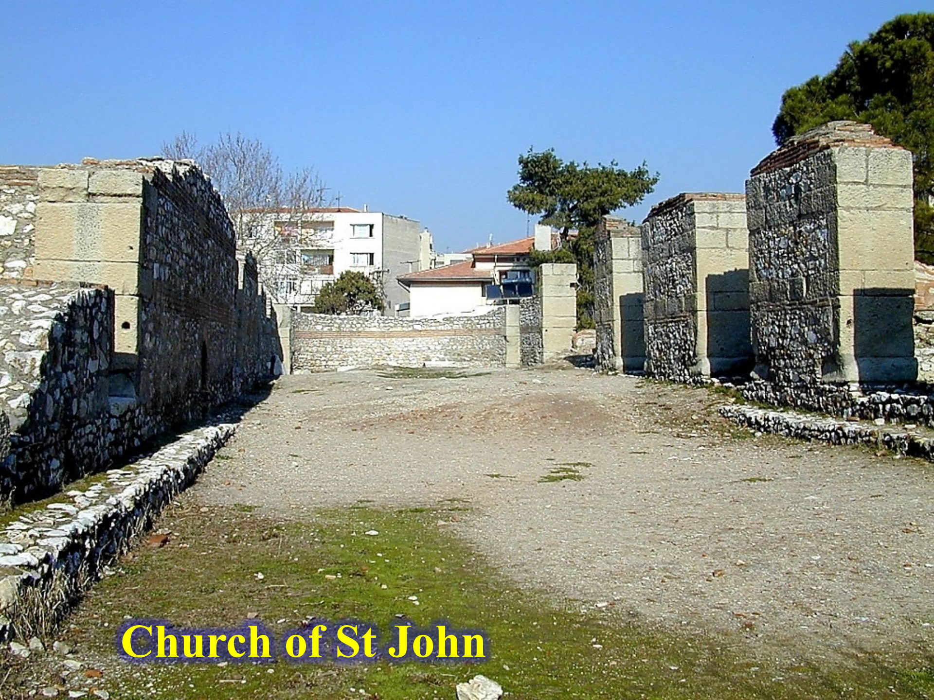
Church of St John